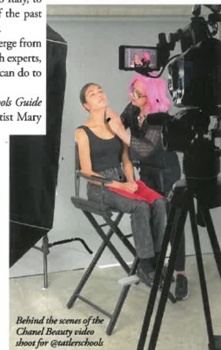
Behind the scenes of the Chanel Beauty video shoot for @tatlerschools