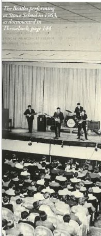
The Beatles performing at Sousse School in 1963, as documented in Throwback , page 144