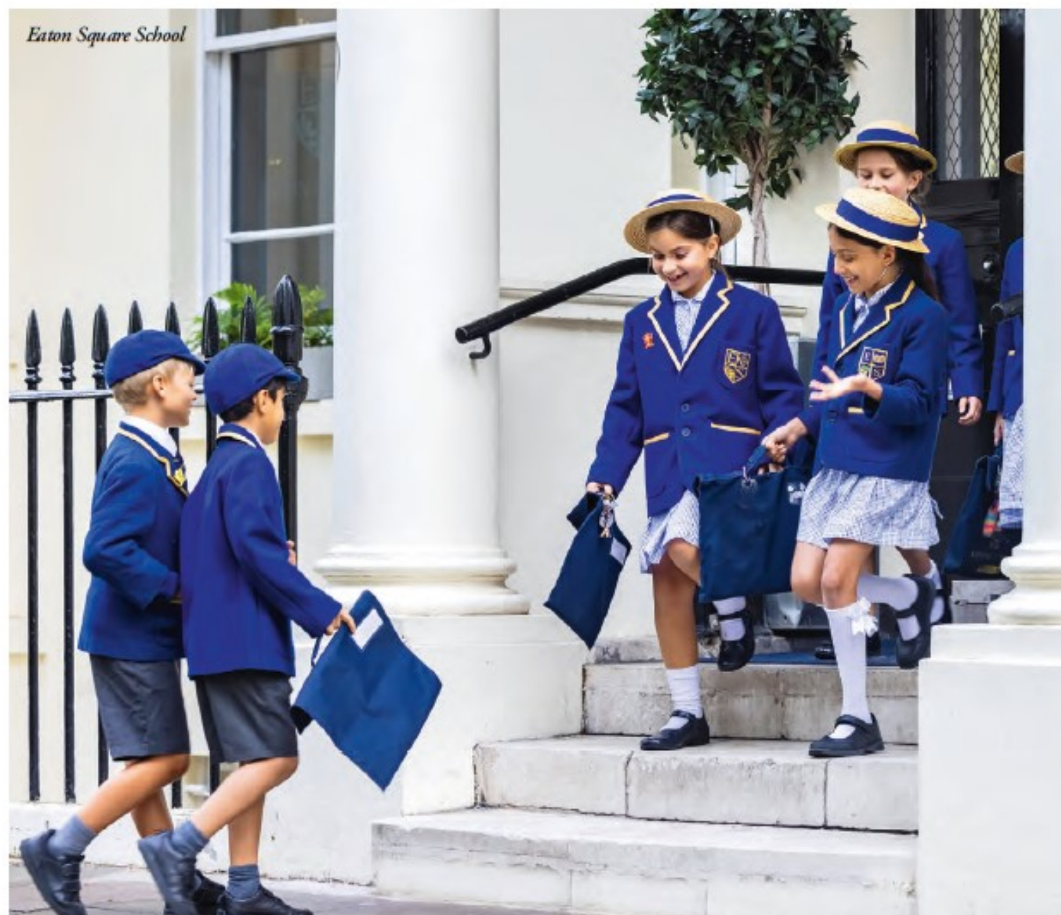
Eaton Square School

'An amazing mix of French academic rigour and the English system which promotes wellbeing, sports and activities', is how one parent describes this school. With children easily flitting between English and French, and emerging truly bilingual both linguistically and culturally, L'École de Battersea offers what principal Frédérique Brisset calls 'a gift for life'. Parents compliment the school's nurturing environment and sensitive reaction to the pandemic. 'The crisis has highlighted a challenge: how to ensure that pupils are not only developing cognitively but are also happy and resilient,' explains M. Brisset. 'It has brought to the forefront the important role school plays in looking after the overall wellbeing of its community.'