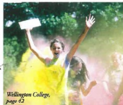
Wellington College, page 42