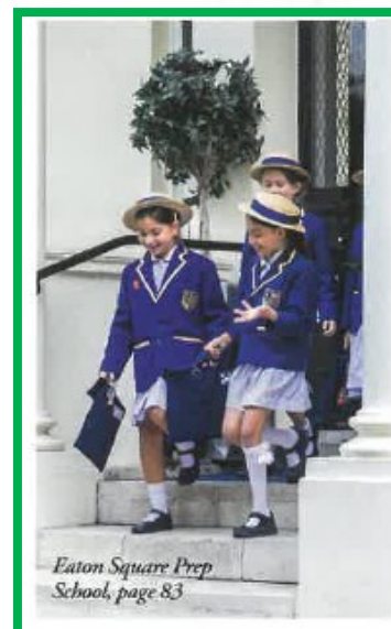
Eaton Square Prep School, page 83