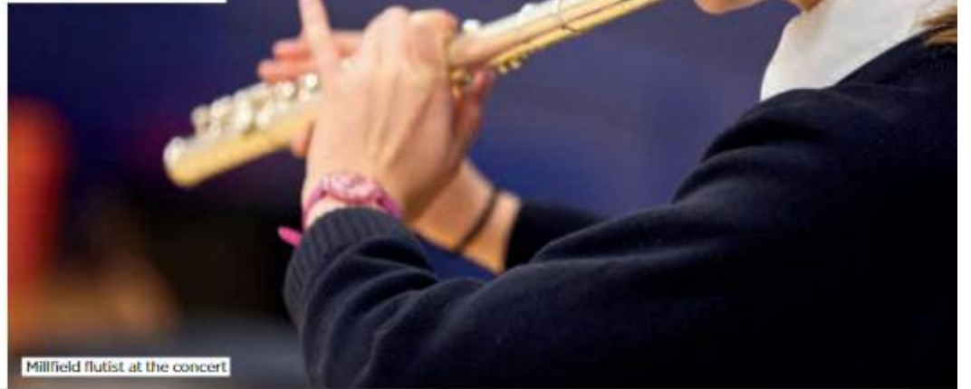
Millfield flutist at the concert

Millfield Prep School debuted 'The Eye Meets the Ear' concert, a collaborative art and music event, encouraging pupils and parents to create art while listening to live music. The concert, which saw the return of parents to Millfield Prep's Glastonbury campus, stimulated the senses, encouraging listeners to create something immediate that conveyed what they could hear in the music.