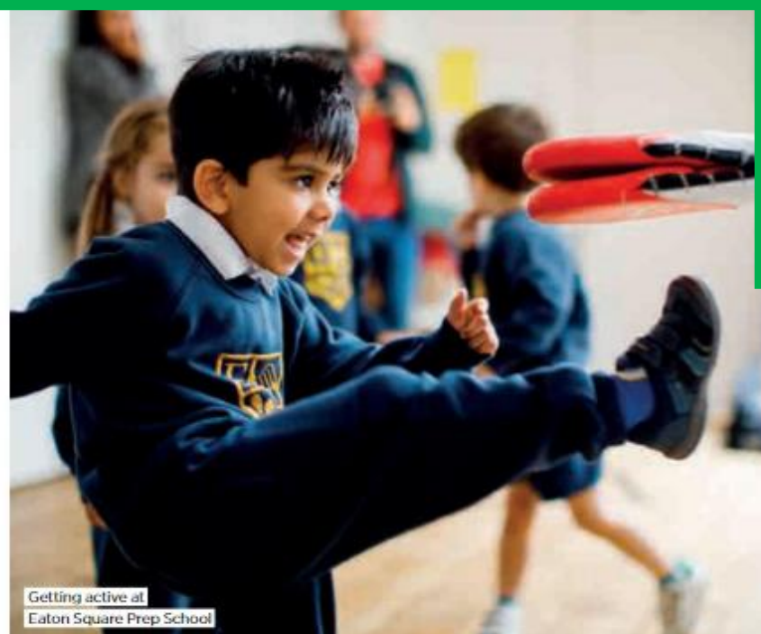
Getting active at Eaton Square Prep School

of Handel's Amadigi at Hexham Abbey earlier this month. The performance was part of the English Touring Opera's autumn tour, which is visiting towns and cities up and down the UK.